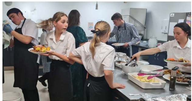
Students cooking up a storm at a recent fundraising dinner. They also achieved NCEA food technology credits.