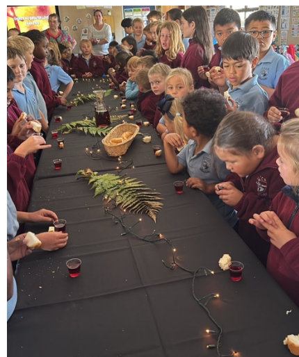
Communion with the junior school