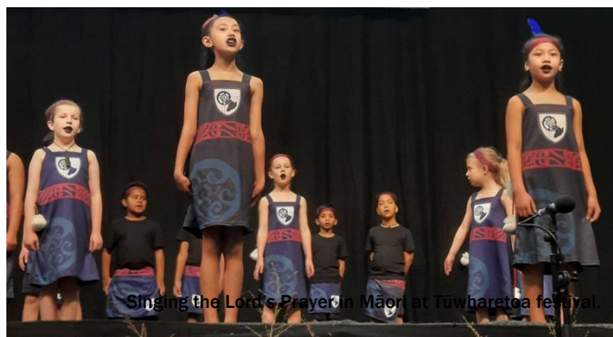
Singing the Lord's Prayer in Māori at Tūwharetoa festival.