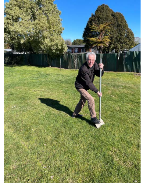
School Presiding Member turning the turf to signal the start of building developments.