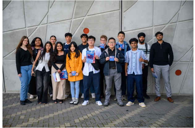
Year 13 students who attended the Forum on the Family Conference hosted by Family First towards the end of Term 3.